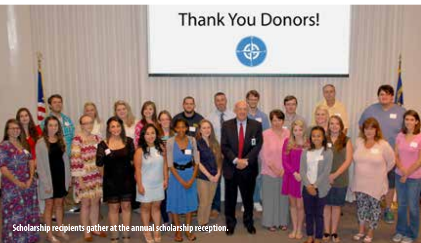
Scholarship recipients gather at the annual scholarship reception.

Donations to the General Scholarship Fund are needed to increase the number of unrestricted scholarships and assistance funds available to students who share the financial challenge of staying enrolled and focused on their educational and career dreams.