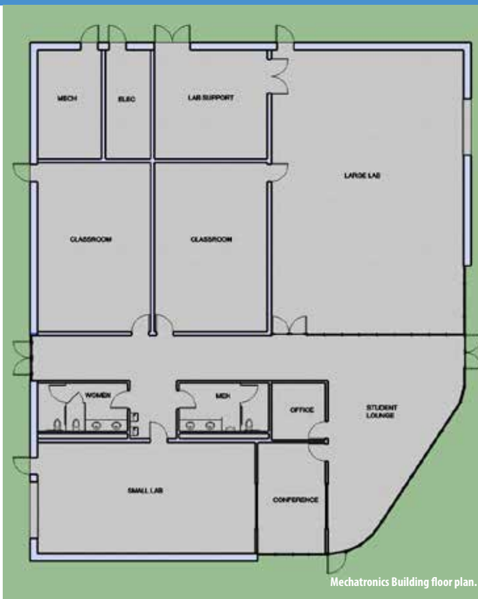
Mechatronics Building floor plan.