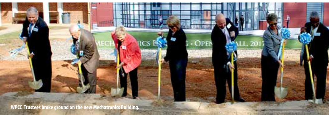
WPCC Trustees broke ground on the new Mechatronics Building.

WPCC's new Mechatronics Building will be complete in 2018 and several naming opportunities exist to make long-lasting tributes of your generosity. Honor or memorialize a person who has influenced you, or the College in a special way. For our local industry partners, naming rights provide a way to show your commitment to the College and a way to reach future employees.