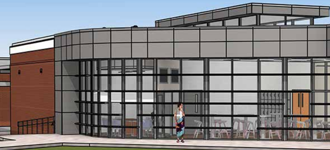
Mechatronics Building rendering.